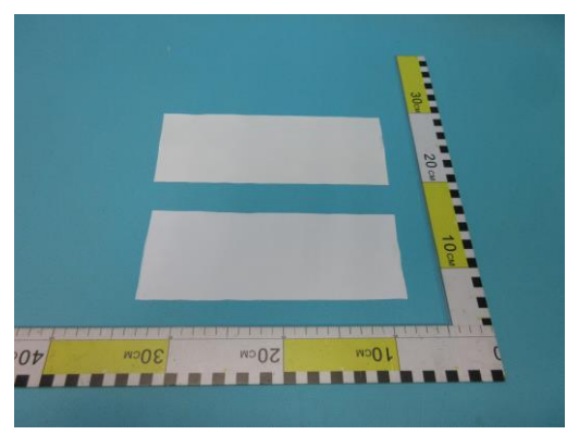
****** To be continued******