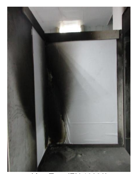
After Test (EN 13823)

SGS authenticate the photos on original report only Note: The above test was carried out by SGS-CSTC Standards Technical Services Co., Ltd. Shunde Branch. ****** End of report*****